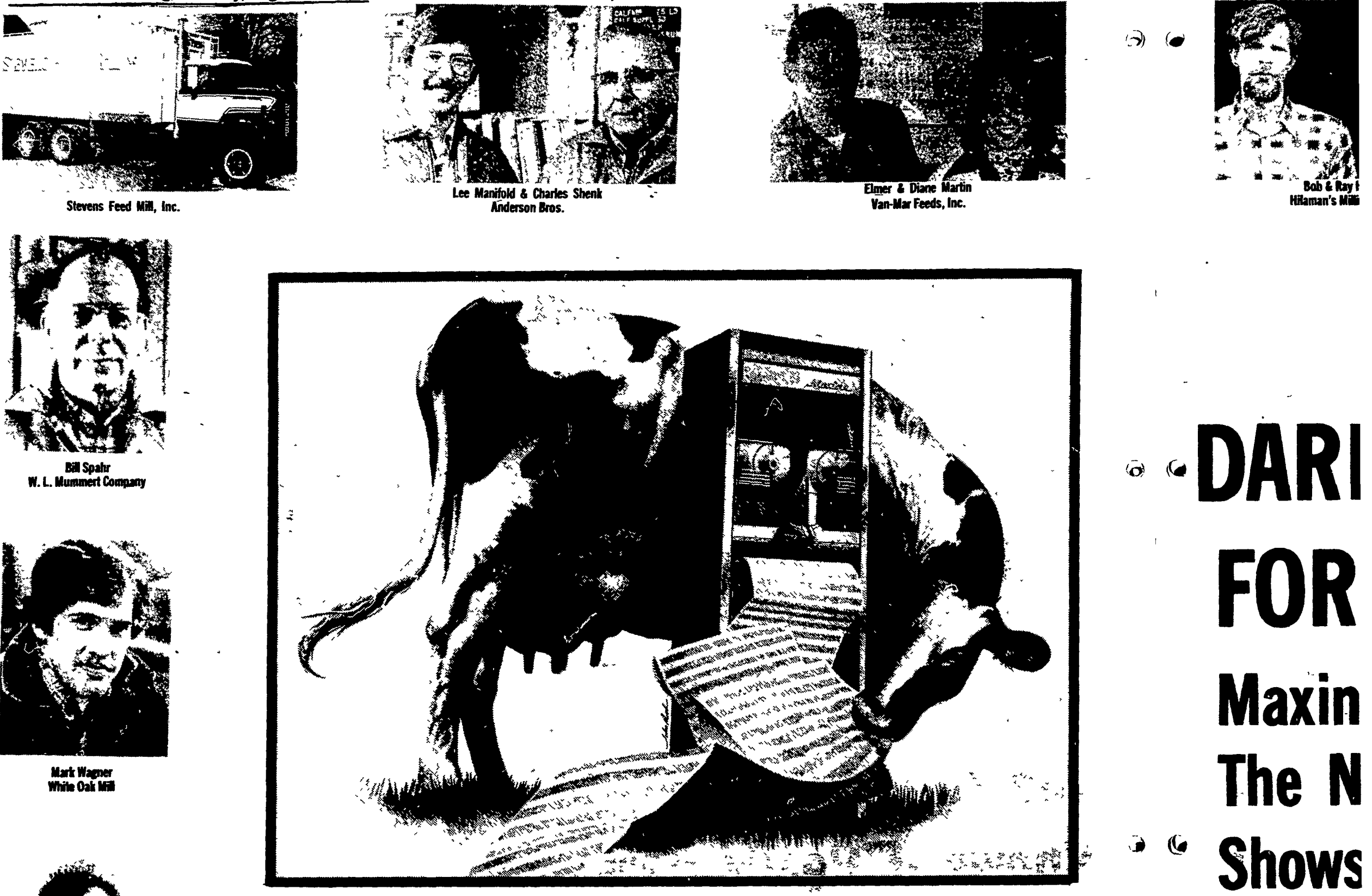
60-Lancaster Farming, Saturday, August 6, 1977