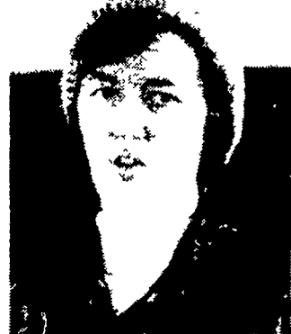
Barbara Batz Batz Feed and Supply

Wayne Dari-Forage Balancer gives you a complete one-feed milking ration for summer pastures or green chop. You can feed for full bred-in production. Yet keep feed costs in line by paying for only the protein you need when you need it.