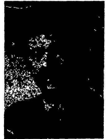
LEON MOYER Sales Mgr.

Please bear with us until we can supply you with more accurate graphing charts."