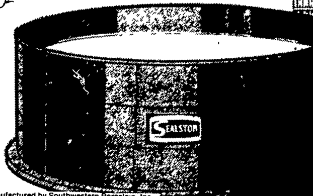
Sealstor products are manufactured by Southwestern Porcelain Inc., P O Box 8 Sand Springs Oklahoma 74063

Clip and mail the coupon to: PENN DUTCH FARM SYSTEMS INC. RD1 BOX 77 KINZER, PA PH: 717-768-3873