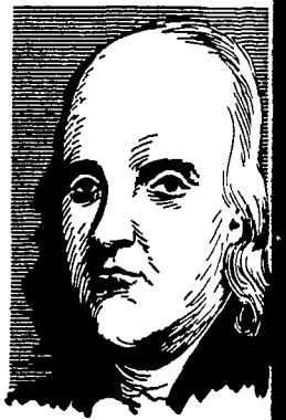
Avarice and happiness never saw each other, how then should they become acquainted Benjamin Franklin