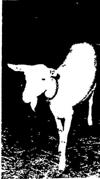
The goat - a calf-sized milk producer - provides milk to millions around the world.

Goats' milk is also highly nutritious. It contains many essential nutrients needed by the body. In fact to get the nutrients supplied by one quart of goats' milk one would have to eat the following amounts of food: one pound of lean beef steak, one pound of chicken, one and two-thirds pounds of peas, eight eggs, seven oranges, three and one-fifth pounds of codfish, five pounds of spinach, three and one-half pounds of oysters, six tomatoes and six bananas. During the Summer months, hundreds of goats will be shown at fairs and goat shows throughout the state. At last year's Spotlight Sale, sponsored by the American Dairy Goat Association, the top selling goat was a seven month old