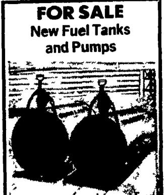
FOR SALE New Fuel Tanks and Pumps

R.D. 2 273 East Rising Sun, Md. 21911 301-658-5568 - 301-398-6132