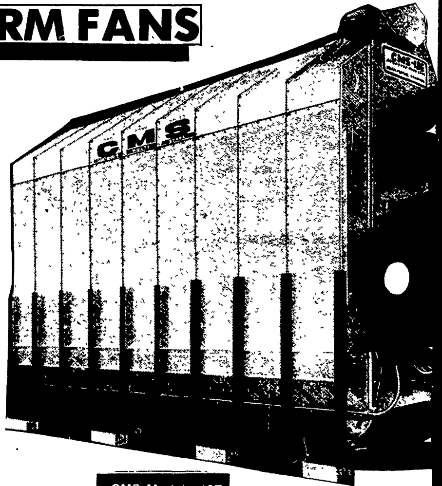
CMS Model—18E Temper Dries to 600 bu. per hr.