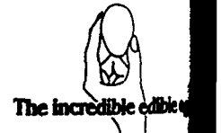
The incredible edible pig