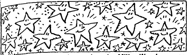
Some astronomers estimate that the Milky Way has some 100 billion stars.