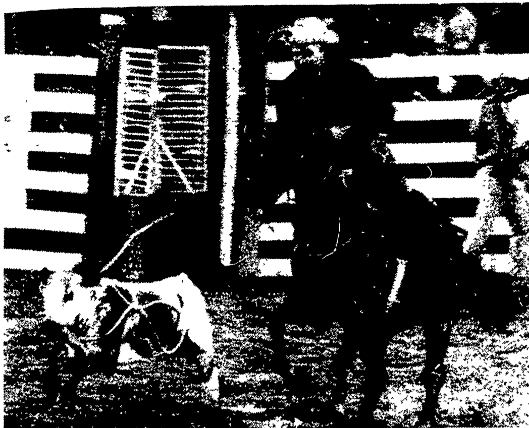
Pro-rodeo cowboys pay entry fees of $20 to $30 to participate in rodeo events. Then they get a chance to win

a part of the $3000 offered each week in prize money at the Cowtown Rodeo.