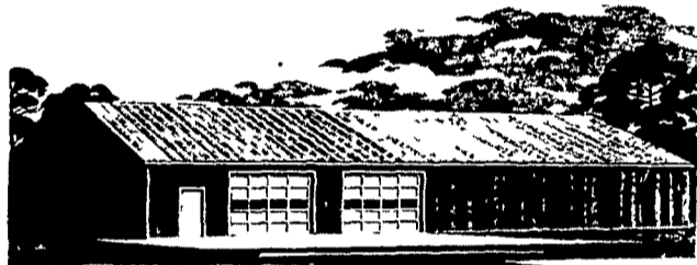
Agway utility building versatile on-farm storage