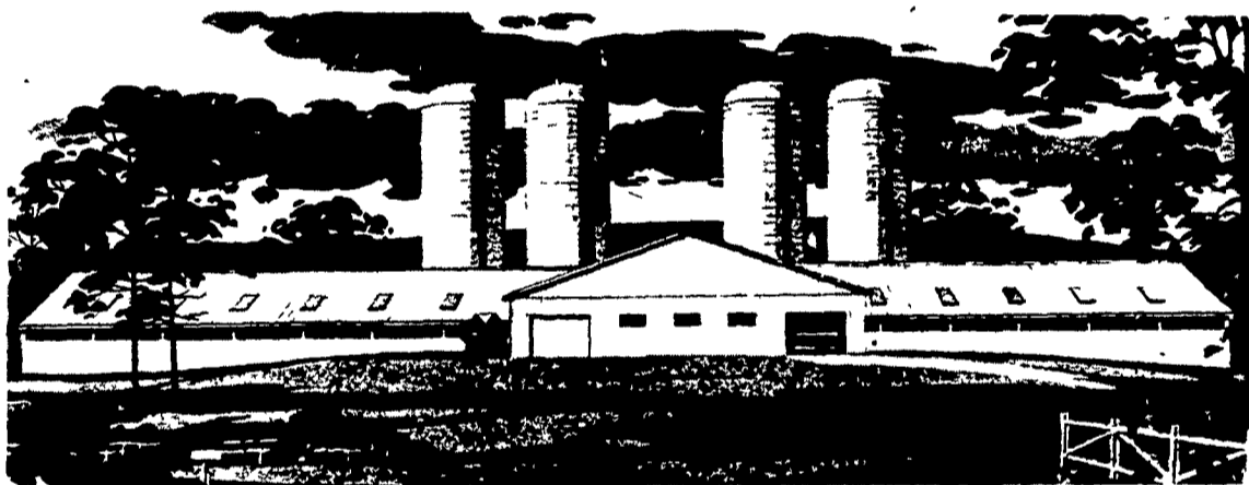
Agway free stall barn engineered for expansion