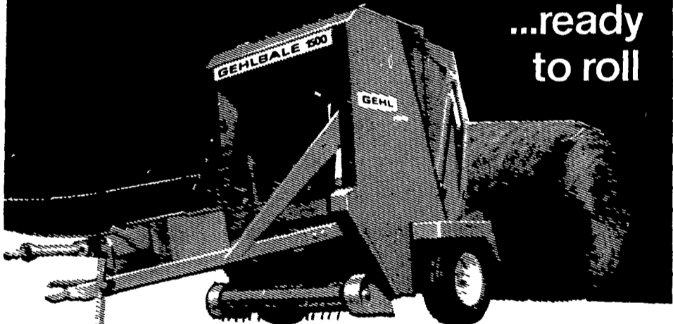
Makes a 1500 lb. round bale.

If you're a farmer you know what a day or two delay at harvest time can cost. Nutrients lost from a few days delay can mean hundreds of dollars spent for the purchase of additional supplements at feeding time. Now, one man can cut harvesting time and reduce costs with the GEHLBALE 1500. The need for large crews, traditionally associated with conventional baling methods, is reduced or eliminated. First crop hay harvest may be completed in the few days the crop is in the proper stage of maturity for maximum quality and feeding value. Because more hay is harvested in a given amount of time especially first cutting hay harvest can more economically compete with planting and care of other crops. The Gehlbale 1500 also promotes the use of corn stalks and other crop residues for bedding or livestock feed. Don't consider another round baler until you have all the facts on the Gehlbale 1500. Stop by soon. The Gehl is 'ready to roll'!