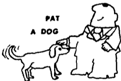
PAT A DOG

SHEEP 5. Not enough of any one grade to establish a market.