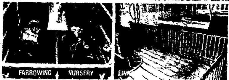
Open Front Finishing Building - INTERIOR

Put your swine operation into a Morton System. Gain the labor and feed efficiency that only a confinement system can offer.