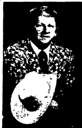
The Detroit Connection The Man with the Direct Line to Detroit

For Sale - 1973 Ford LTD dr. hardtop, 351 engine, 45,000 miles, loaded, real nice clean car with new tires, must be seen to be appreciated. Priced at $2,350.00. Ph: 717-436-8628