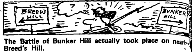
The Battle of Bunker Hill actually took place on near-Breed's Hill.