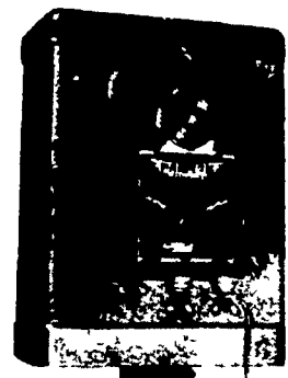
PARMAK DELUXE FIELD Model A-DF

6 volt, battery operated. The world's largest selling battery operated fence. Built-in fence tester and lighting arrestors. Furnished with mounting bracket. Fully Warranted. UL listed. Charges up to 25 miles of fence. Outdoor installation.