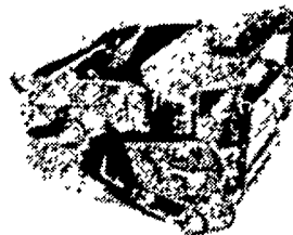
New cutter assembly ... still $975! Componentized construction permits easy replacement or repair of major components. This new, factory-assembled cutterbox is available for just $975, less optional knives and shear bar.

Componentized construction lets you restore performance with new, factory-assembled components, often at lower cost than overhauling the old assembly.