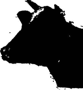
Mount Joy, PA 17552