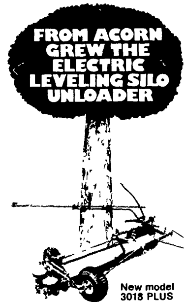
FROM ACORN GREW THE ELECTRIC LEVELING SILO UNLOADER