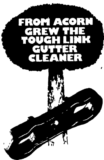
FROM ACORN GREW THE TOUGH LINK GUTTER CLEANER