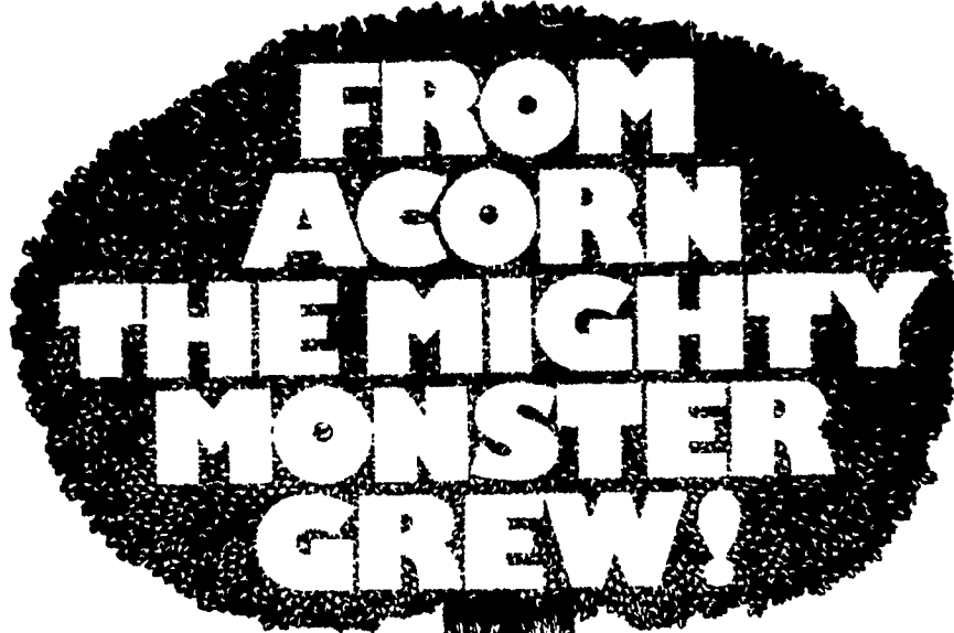
FROM ACORN THE MIGHTY MONSTER GREW!