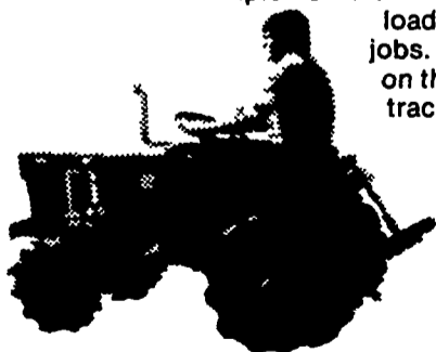
15 HP 4-WHEEL DRIVE

From the inventors of the compact diesel engine. Used throughout the world. Specially designed diesel engines for reliable power with incredible fuel economy. Three point rear hitch. 2-speed PTO accommodates a full range of tools and implements. For mowing, spraying, dusting, tillage, loading, hole digging, and many other jobs. Call or write for facts on these tough compact tractors with big value.