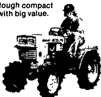
13 HP 4-WHEEL DRIVE