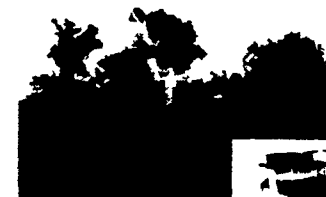
Maintains traction for grades or wet grass