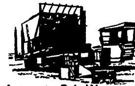
Automatic Bale Wagon

And remember, they're backed by the SPERRY NEW HOLLAND parts system.