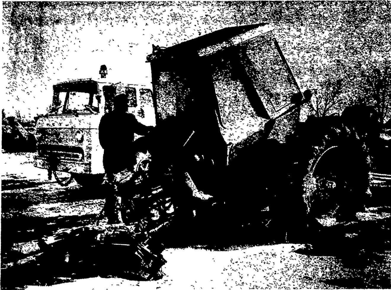
Not much was left of this Allis-Chalmers farm tractor after being hit by a freight train, except for the cab. The special protection offered by the cab may have saved the driver's life. The front end was torn off and the remainder of the tractor and cab hurled against the train.