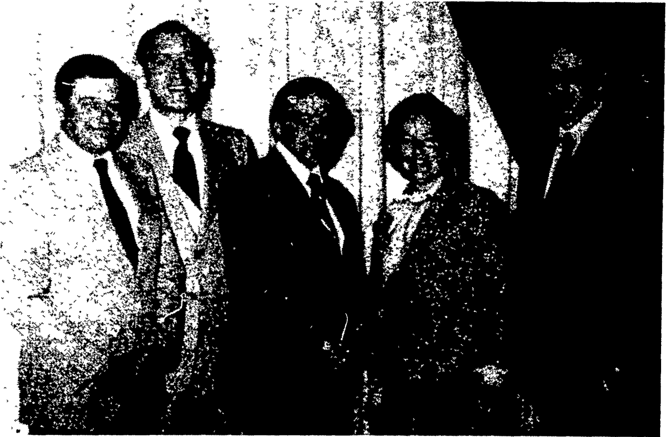
More than 500 persons attended the annual legislative banquet of the Pennsylvania Farmers' Association in Camp Hill last week to discuss important agricultural legislative issues.