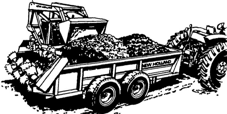
Model 790 Spreader

SPERRY NEW HOLLAND UTILITY LOADERS ADD MECHANICAL MUSCLE TO YOUR OPERATION.