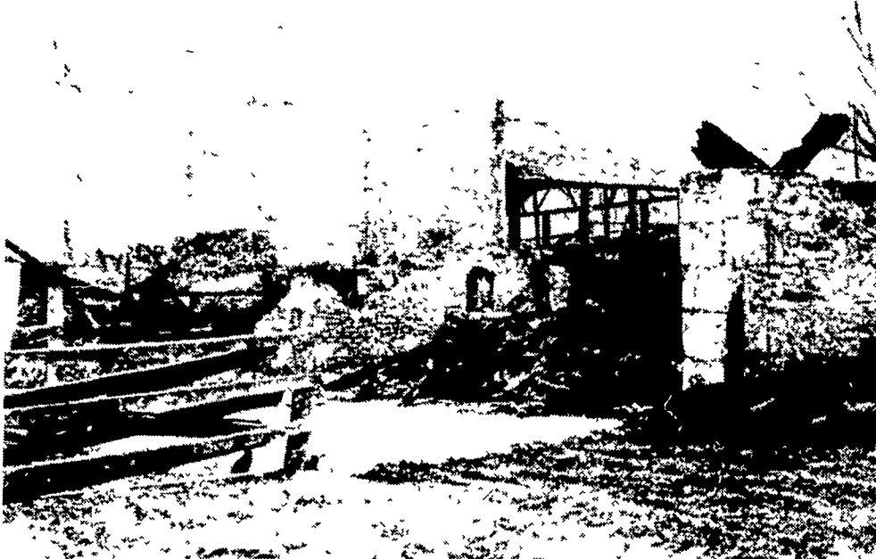
Consumed by flames, a once stately barn was reduced to rubble.