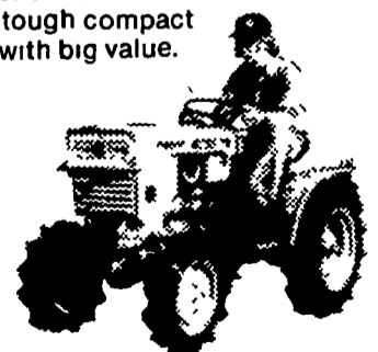
13 HP 4-WHEEL DRIVE