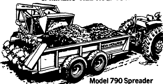
Model 790 Spreader

NOW WAIVER OF FINANCE ON SPREADERS & MIXERS TILL AUG. 1ST.