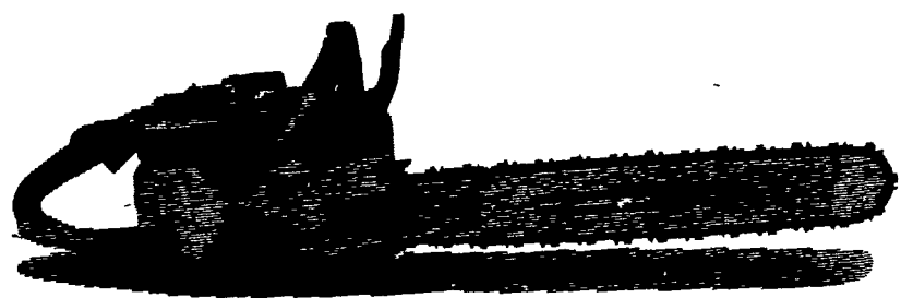
Model 031 AV

THIS IS THE BIGGEST SELLING LIGHTWEIGHT PROFESSIONAL CHAIN SAW IN THE WORLD.