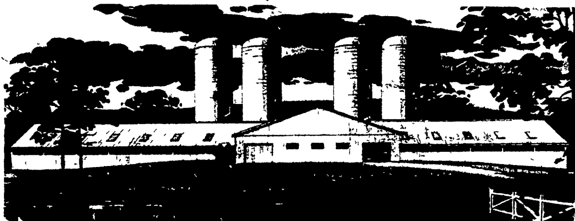
Agway free stall barn engineered for expansion