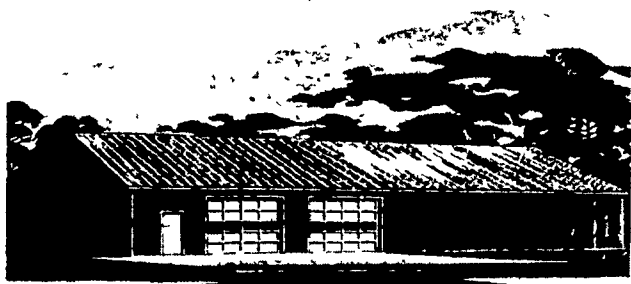
Agway utility building versatile on-farm storage