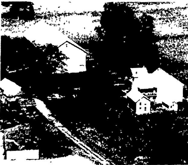
(Not an up-to-date photo. Less trees on property)

On the Premises in Jackson Township, Lebanon County, 2 1/2 miles South of Myerstown Airpark. Township Route 560.