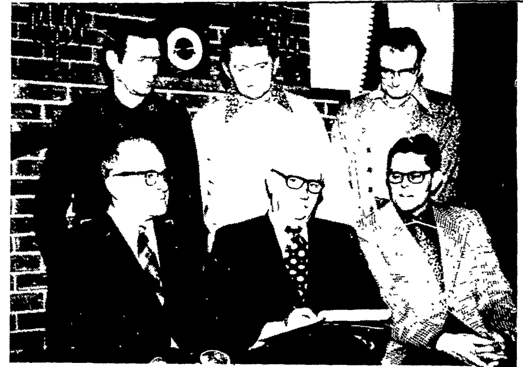
The Keystone Grange legislative committee met recently with Representative G. Sieber Pancoast of the local 147th District to discuss legislative activities. Those present

Proper disposal of sewage sludge was a major topic of discussion, and it was decided to have the committee's proposal for continuing research with this environmental sludge treatment plan be presented to the local, pomona, and state Grange units in the form of a resolution. The committee also requested legislative support for the appropriation request by Pennsylvania State University as presented. The committee continued its efforts to have the State Institutional Farms retained