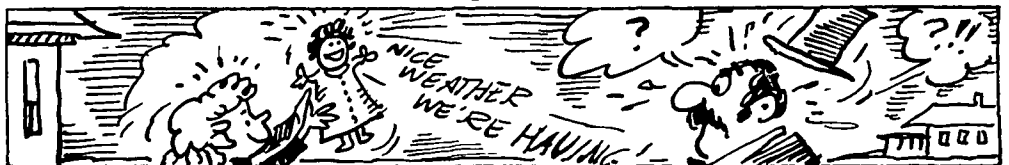
The first talking doll was invented by Thomas Edison in 1888.