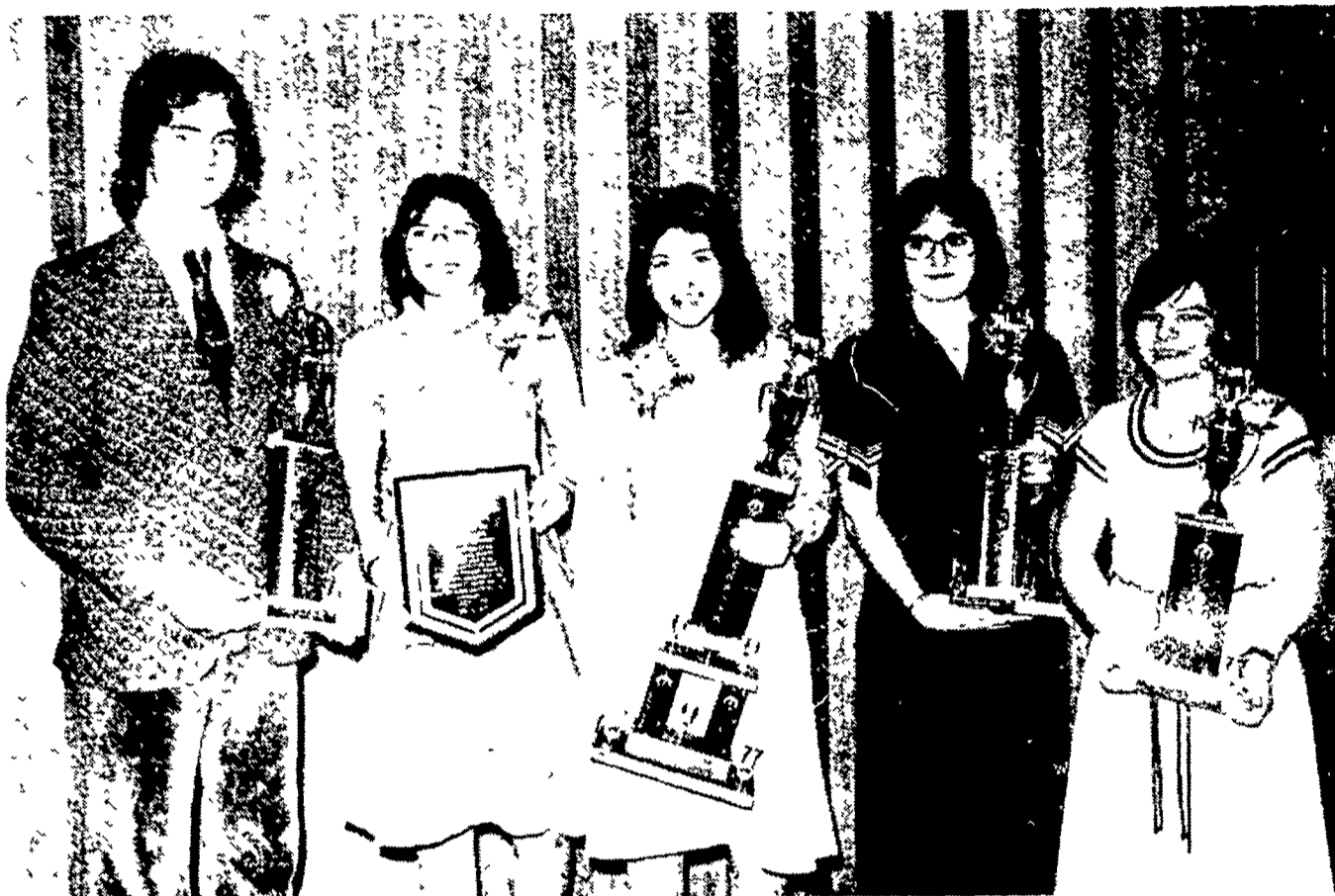
Winners in the Cumberland County 4-H Baby Beef Club award program, sponsored by the Mechanicsburg Area Chamber of Commerce, were,