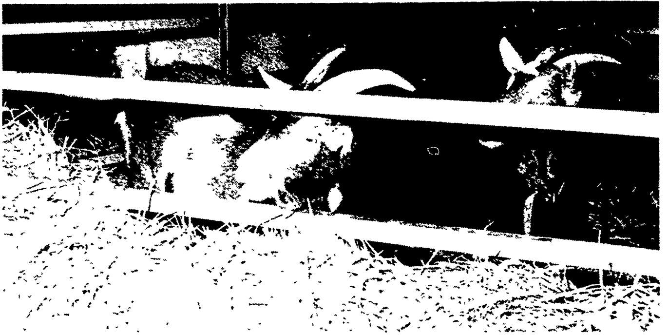
There's a lot to look at in Lancaster Farming — the goats know.

decide which format—cassette, cartridge, open reel or mini cassette best meets your needs