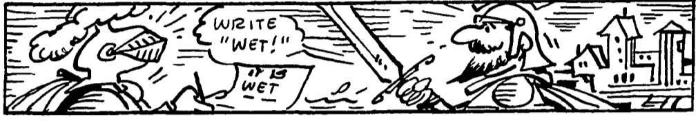
The first flood in America of which there is any known record was that of the Mississippi River. It was recorded by Fernando De Soto in 1543!