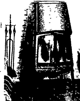
"THE COMBI-FIRE" The Free-Standing Fireplace That Converts To A Stove!