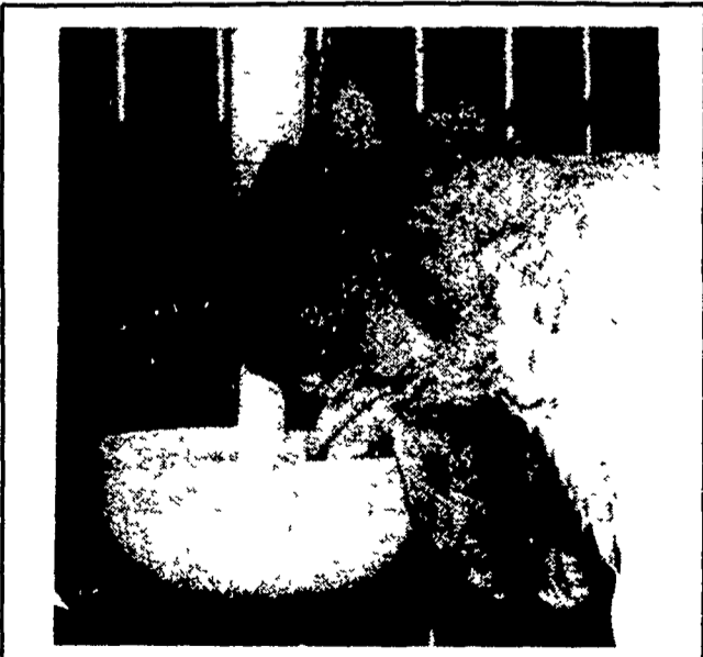
Val-Cup watering system Val has water to your birds at all times

We design and manufacture our systems for you which enables you to use your management skills and poultry know-how to increase production, efficiency and profits.