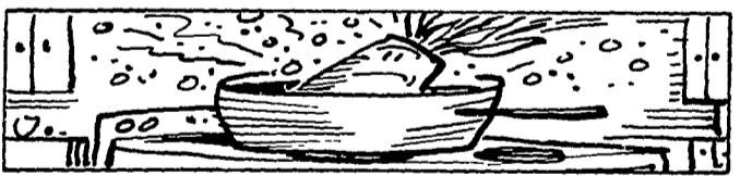
Each time a vegetable is reheated, it loses some of its water-soluble vitamins and minerals.