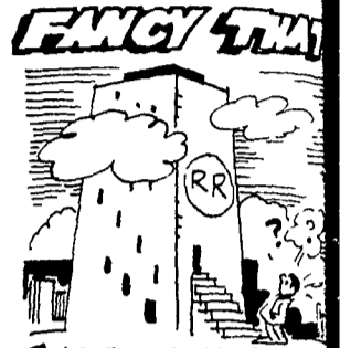
THE RAILROAD STATION WITH THE LARGEST WAITING ROOMS IS IN PEKING, CHINA. 14,000 PEOPLE CAN TAKE A LOAD OFF THEIR FEET WHILE THEY'RE WAITING FOR THEIR TRAIN TO COME IN!

FOR THE WEEK Compared to late last week feeder cattle and calves led the early advance to close near steady; cows steady 50 cents lower; bulls 1.00 higher; salable receipts near 14,600 head compared 13,243 last week and 18,450 head the same week a year ago. Cows and bulls near 10 per cent of the cattle receipts; feeders 86 per cent of the total.