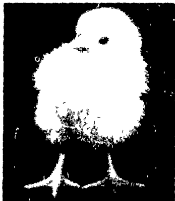
Everything the chick needs for a safe start