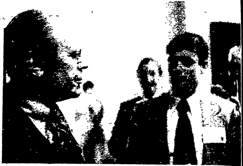
Farm issues were discussed in Washington D.C. last Spring by top officials and members of the

Farm editors from all across the United States met in Washington, D. C. in late April. Among their activities were meetings with ag spokesmen on Capitol Hill and President Ford. One of the many bits of news to come out of it was that world grain production was expanding and that demand for U.S. grain abroad would slacken a bit for the near future.