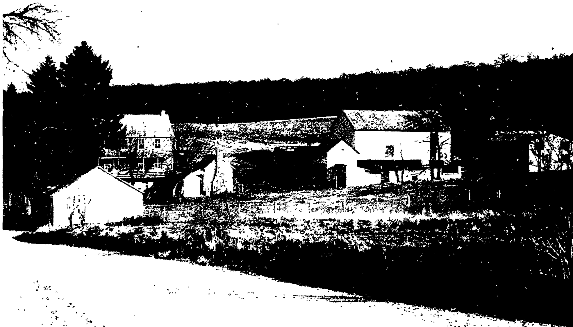
Nestled in the southern York County hills, the Masimore farm still boasts its old blacksmith shop, extreme left foreground, where German immigrant