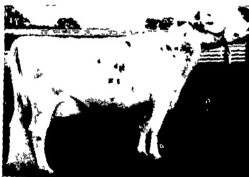
DAM. U K DEAN DUKE BECKY SUE [EX-91-2E] 5-7 305d 32900M 1036F Owner: Univ. of Kentucky, Lexington, KY