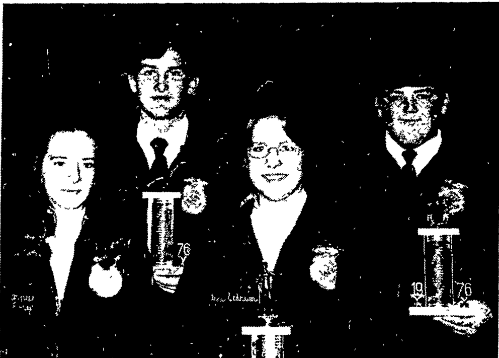
Receiving awards for outstanding performances within the York County FFA program were, left to right,