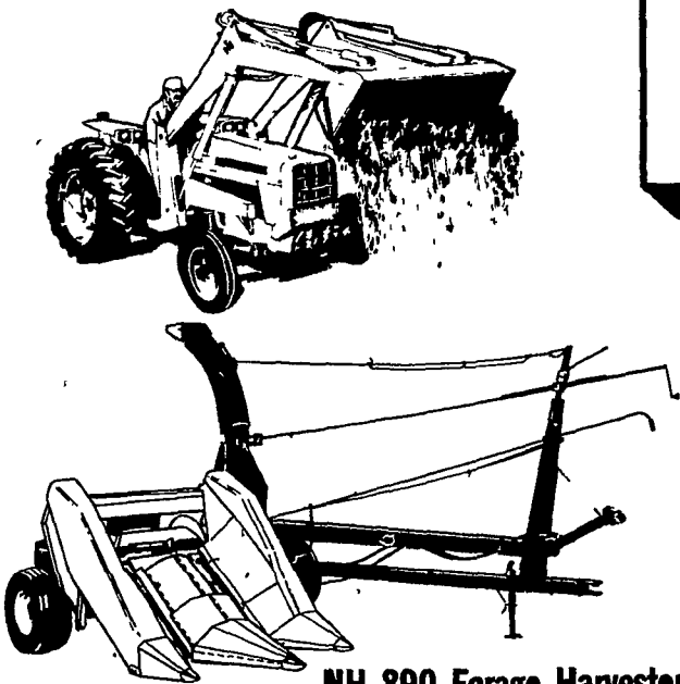
NH 890 Forage Harvester