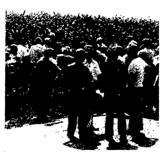
Farmers enjoy the day at the Chester County Corn Hybrid Display plot.

On November 1 starting at 9 a.m., the plots will be hand harvested. Farmers are invited to attend. Bring your husking peg, and observe the differences. Rain date is November 2.