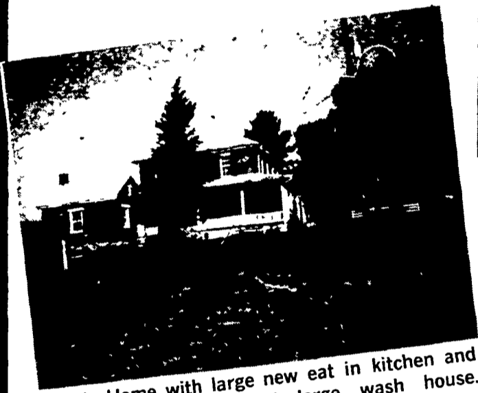
Lovely Home with large new eat in kitchen and Extra Large rooms and large wash house. Remodeled approx. 8 mos. ago. No woman can resist this.