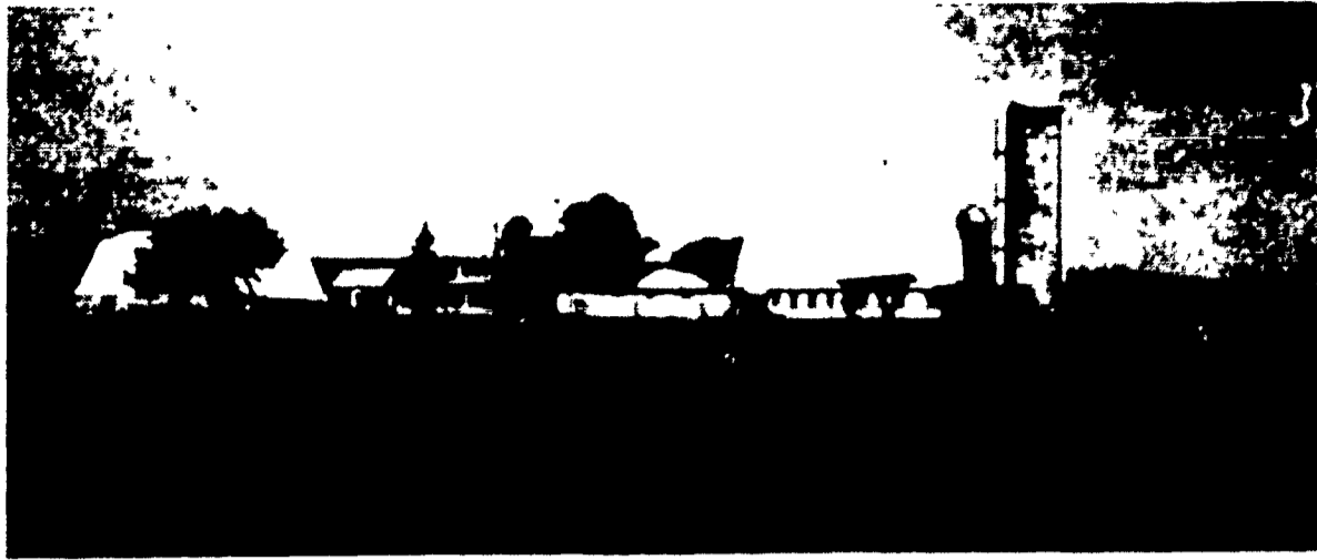
This farm is a lovely picture farm as you can see. Lay out of buildings is for easy access to all buildings and very convenient for working. Buildings set in center of farm.

FRANKLIN COUNTY - 100 ACRES PRICED LESS THAN $1500. PER ACRE