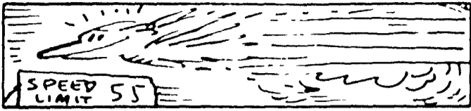
The fastest bird in the world is called the swift!

Know Where the Activities Will Be? Read the Farm Women Calendar.