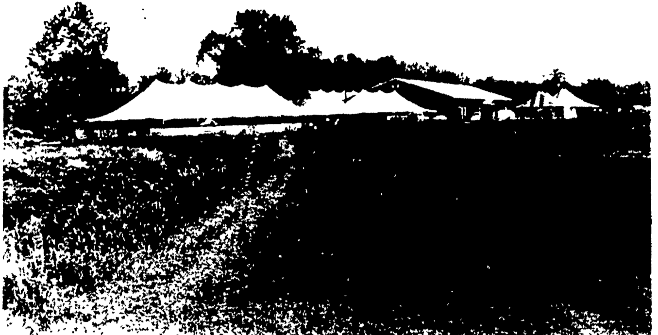
The agriculture exhibits of the Manheim Fair moved to a location beside the high school this year. Seen from a distance are the new commercial building and livestock tents clustered around it.