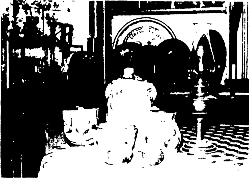
Some of Barbara's other sgraffito ware which is on display in Taylor Mansion Pottery is shown here.